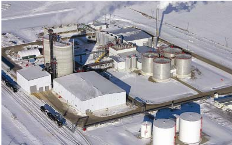
Picture at left is a 50 million gallon per year ethanol plant similar to that which Todd & Sargent is building for Lincolway Energy and Suncor Energy.