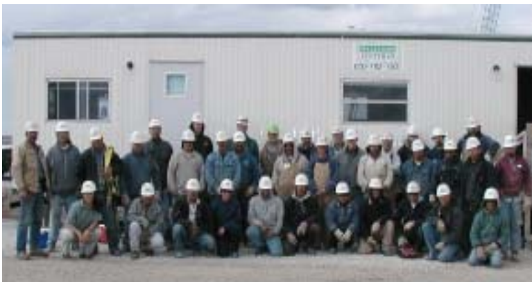
Todd & Sargent crew working on the VeraSun Energy facility in Fort Dodge, Iowa.