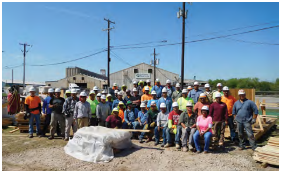
The T&S crew working at the new 20,000 CWT flour mill for Miller Milling in Saginaw, Texas.

The Todd & Sargent crew poured the flour mill main slab foundation on March 22, 2017. The main slab is approximately 100' wide x 180' long and incorporates 1,224 yards of concrete. Due to congestive traffic in the Dallas-Fort Worth area, crews began pouring concrete at 1:00 in the morning and were finished by noon.