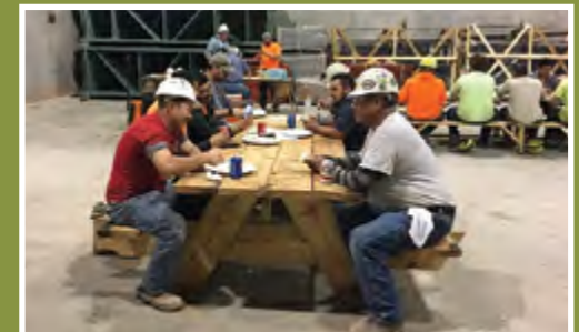
Wayne Farms - Ozark, AL, Crew