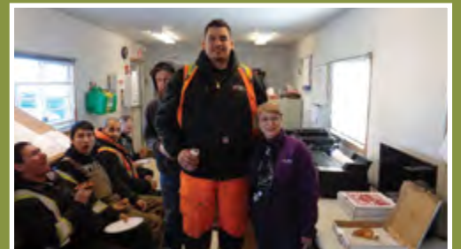
GrainsConnect Canada - Maymont, Sask., Crew