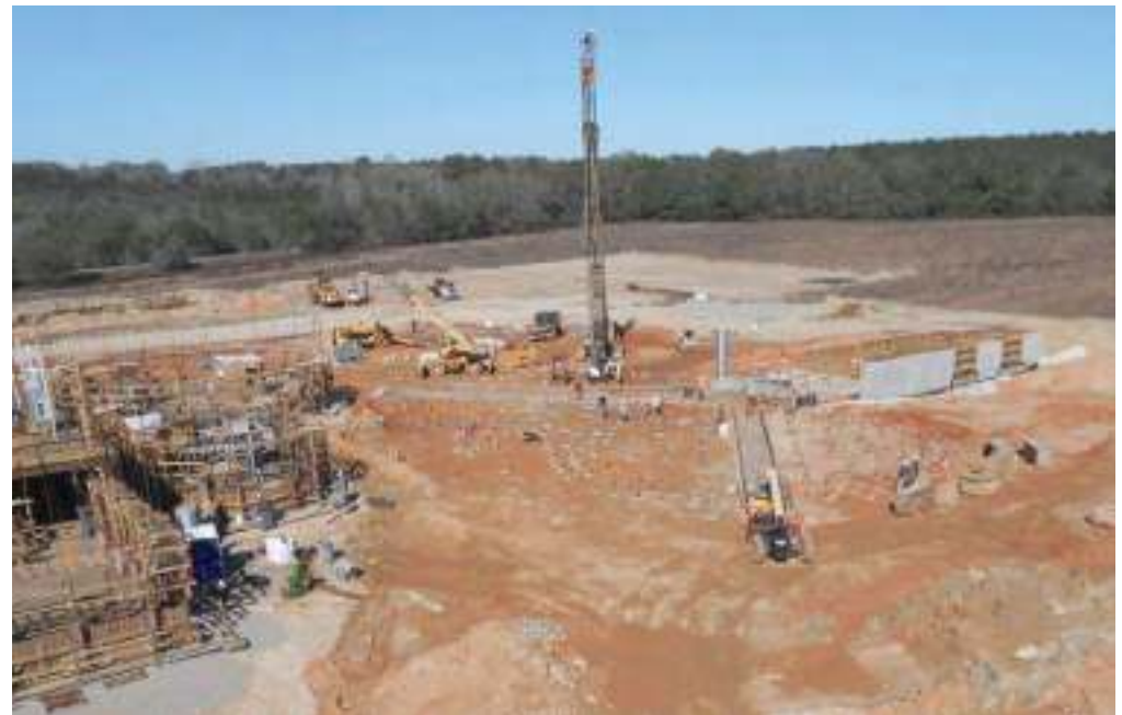
Above photo shows the piling rig finishing up on the auger cast piles under the grain silo complex. Mill slipforms are shown on the left. The rail receiving transfer tunnel is shown at right.

Construction is underway at the new Wayne Farms 25,000 ton per week feedmill located near Ozark, Alabama. The feedmill slip is scheduled for January 18, 2016. This new facility will include two rail receiving systems, one truck receiving system, ingredient storage bins, 1,000,000 bushel whole grain storage, 240 TPH grinding system, 4,200 tons soybean meal storage, dual batching, 270 TPH pelleting, complete plant automation, electrical, and mechanical installation.