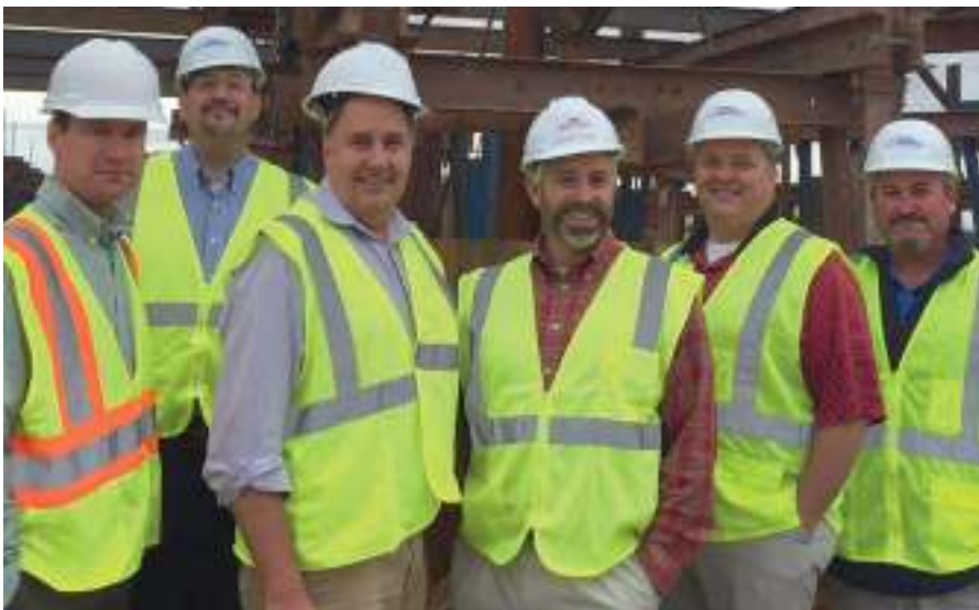
Site tour and inspections were conducted by the Wayne Farms executive team after the December monthly meeting.

Wayne Farms LLC is one of the largest vertically integrated poultry producers in the U.S. They own and operate 11 fresh and further-processed facilities throughout the Southeast and produce more than 2.6 billion pounds of poultry products each year.