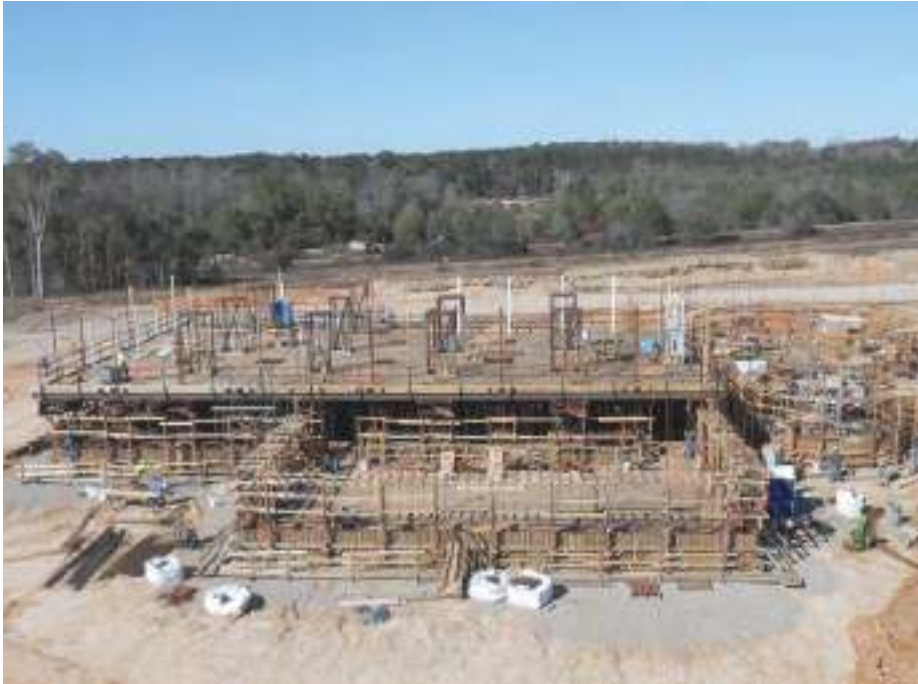
Photo shows Wayne Farms feedmill ready to slip on January 18, 2016. Pelleting core is in front, dual truck loadout bays at left, and mill batching and ingredient tower in center.